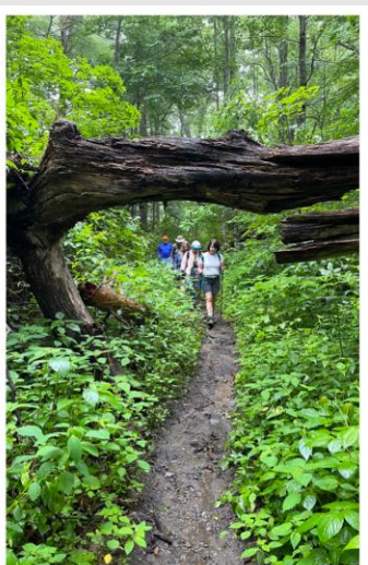
Once again, I missed the wildflowers that are beautiful here, but the waterfall remains spectacular. The group of seven hiked the slippery slopes to get to the waterfall and seven made it out intact.