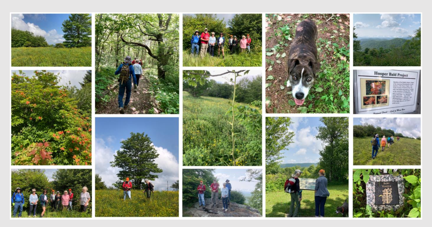
The group met at the Cherohala Skyway Visitor Center and carpooled to the first stop, Hooper Bald. The short hike to the top was rewarded with several of the wild flame azaleas in bloom. We also saw balds covered with yellow buttercups. One interesting plant observed was the Blur Ridge carrion flower, which seems to be common at this location. Leaving Hooper, we made the short drive to the Huckleberry Knob trailhead and hiked the mile to the top. The weather was nice, with a slight breeze and temperature in the low 60s. This was quite a change from the low 90s in the valley. After a lunch on the bald, we began our walk back down to the vehicles, enjoying the spectacular views along the way. It was a great group, with lots of interaction about the plants and some interesting insects we saw along the way. The group included Maryl Elliot, Sandra Fenton, Sue Robinson and Zoe, Leslie Auriemmo, Danny Yarberry, Anne Anderson, Judy Price, Charlie Snow, and Event Leader, Jack Callahan. Jack Callahan